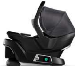
Fig. 5: For mothers self-installing car seat

The baby car industry is big business, the card has shown that almost 80% of the seat purchased are wrong install and fitted [7]. The self-installing car attach directly attach itself to the base of the seat. In it there is a robot in the base of the care seat so that it can install itself so that it can install itself, so that it cannot be install incorrectly. And it also has contribution after every time placement of child in it verifies the installation. It periodically it continues to check level and connections until the seat is removed. It provides the better child and kids softy while driving the car.