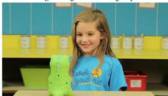
Fig. 4: Cognitive learning Toy

The developing of highly interactive academic and entertainment stuff was never easier before. The IoT has created the Application like IBM Watson, Amazon Lex, and others. It help to map the intelligence of users and provide dues as what to do to take learning to the next level.