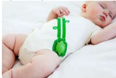
Fig. 6: Safety device (Smart Button)

If the baby rolls on her/his stomach it send immediately real time after to the application or to the nearby IoT Devices. The baby rolling on He/She stomach is not got for the babies. This IoT device is handy when you have babysitter and parent watching your baby.