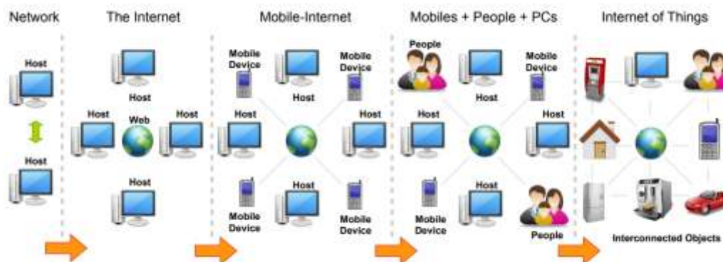
Fig. 1: Evolution of the Internet in five phases [3]

The crucial requirement of the any IoT devices is the connectivity it must be full filled. Diverse devices has many different protocols to communicate it range from a small kind of sensor which sense and generate data and send to the powerful backend Server which process the data with help of Data Analysis and extract the knowledge from it. The IoT has bundle different technological with it such as could computing data modeling, storing, processing and communication technologies to build a proper vision of it.