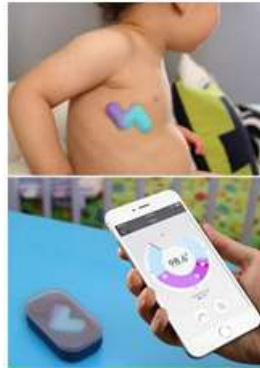
Fig. 7: Fever Scout Wearable Thermometer