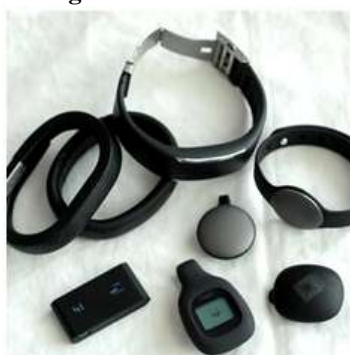
Fig. 3: Wearable trackers

To locate the kids IoT devices mostly uses the Bluetooth and GPS. The benefits of it as allows children more freedom while being watched, monitors children with special needs, who wonder helps monitor children with behavioral problems gives peace of mind to parents.